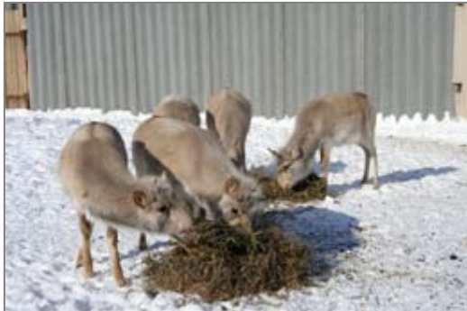
The feeding of young saigas.

The animals were monitored daily after release. When the cold season came the animals moulted and judging by their appearance gained weight. On 13 November an adult male was brought from Kalmykia for the rut. He was released into an enclosure with three females. On 27 December, the male ceased to show any interest in the females. On 12th-15th January, keepers observed signs of heat in the injured female, Jadi, who had recovered from her fractured leg. On 12 January, during the morning feed, she was excited and making loud noises, to which the adult male responded. Young males, separated by a corrugated iron wall, were also excited and making noises. Jadi tried to break out of her enclosure through a slightly opened door, a behaviour that had previously not been noted. In January, the young males started to play-fight, although the lame male was in worse condition than the others. All three females became pregnant. The first calf was born about 6 pm on 17 May, and within 1.5 hours was standing and bleating. The second calf was born on 19th May, and Jadi gave birth to a calf on 14th June.