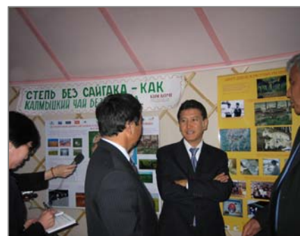
The Head of Kalmykia discussing saiga conservation with the Director of the Centre for Wild Animals.

For further information: http://saigak.biodiversity.ru/news/250506.html