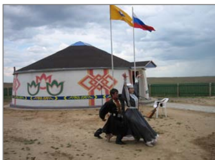
Dancers rehearsing outside the new visitor centre.

The Visitor Centre is equipped with displays about the saiga's ecology and conservation, computer projection facilities, and an exhibition about Kalmykian culture. The breeding centre also has facilities for researchers to stay on site, and a classroom for school visits. It has already formed a close relationship with a number of local and international educational establishments, who come to observe saiga behaviour and learn about captive breeding techniques.