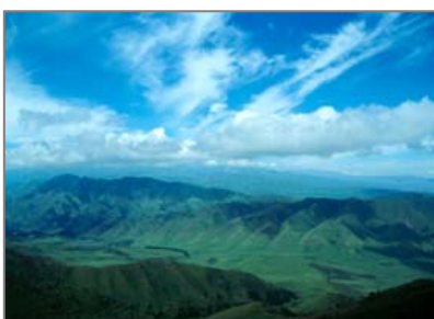
Xia'erxili nature reserve.

The Xia'erxili Nature Reserve (hereafter Xia'erxili NR) is located at E81°43'-82°33', N45°07'- 45°23' along the northern slope of Alataw Mountain in the Mongolian Autonomous Prefecture of Bortala, Xinjiang Autonomous Region, China. The northern border is adjacent to Kazakhstan. The biodiversity in this region has been effectively conserved because there has not been any disturbance from human activities in a long time. This pristine condition is quite rare in Central Asian and Mongolian transition regions.