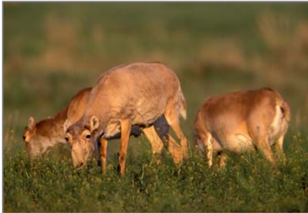
Grazing saiga females.