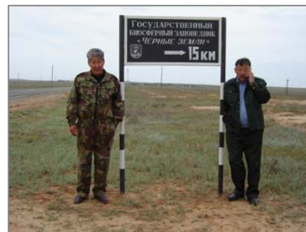
On the border of nature reserve.