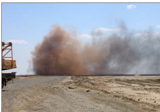
Emergency gas dump, near the Tuley gas-compressor station.

The Ustyurt Plateau is a region boasting unique natural resources, including about 250 vertebrate species. One of Ustyurt's key species is the saiga. Because it is remote, with a low level of economic development, its unique ecosystems are relatively intact. However, a difficult economic situation aggravated by the Aral Sea disaster has resulted in a drop in living standards, and unemployment has become a major cause of human impacts on wildlife. In particular, levels of saiga poaching have significantly increased. However, poaching is not the only threat for this unique species. Implementation of joint projects by Uzbekistan and Russia, involving the development of the region's energy sector, is a serious potential threat to saiga populations.