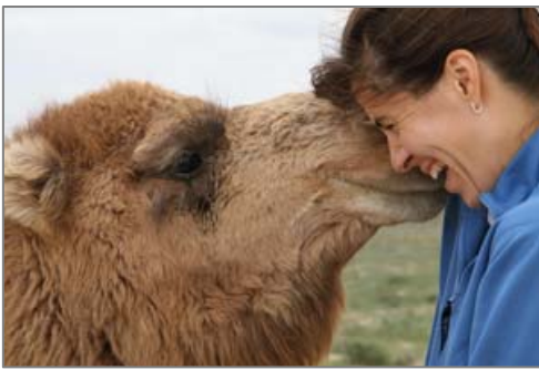
A roadside encounter with some camels in Uzbekistan - love from the locals!

Along the road, we stopped for the night in Samarkand, Bukhara and Nukus. Each city had its own unique charms, including spectacular mosques covered with blue and white handmade mosaic tiles. The stories of these mosques are a fascinating account of centuries of exotic cultures and ancient civilizations. In each city, we enjoyed the warm hospitality and comfort at the local Bed & Breakfast. A highlight of breakfast in Bukhara was a delicious jam made from roses, which are grown throughout the country.