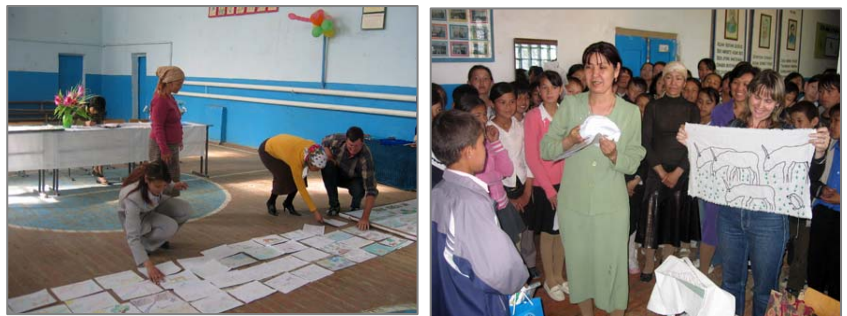
Judging the saiga drawing competition, school #26, Karakalpakiya village (left); Prize-giving for the saiga embroidery competition, school #56, Karakalpakiya village (right).