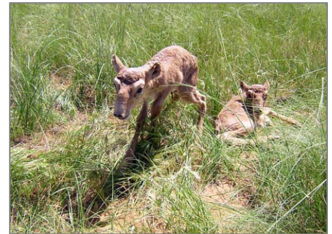
Saiga calves at the Chernye Zemli Biosphere Reserve, Kalmykia, May 2004.

We plan to continue the work started in the INTAS project through further research, with a particular focus on understanding the drivers of saiga movement and investigating the potential of participatory monitoring as a tool for saiga conservation and management. Unfortunately, after 12 years of continuous support for saiga research through difficult times, INTAS will not be funding any further studies, because the European Union has ceased funding this organisation. However we are confident that the strong network which we have created during this last project will enable us to continue our very productive collaborations with new funding sources.