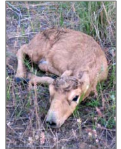
A new saiga calf.