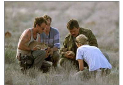
SCA team studies saiga calves in Ustyurt.

We hope that members will also apply to have their conservation activities affiliated to the SCA. Affiliated conservation projects will be able to use the SCA logo and will be given a page on the SCA website to advertise their project free of charge, as well as space in the Saiga News projects round-up section.