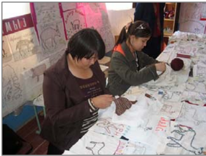
Schoolgirls embroider a saiga, school #56, Karakalpokia village.

This project is carried out by the Saiga Conservation Alliance with the financial support of the WCN, Sidney Byers Trust, and donations. It is also aimed at raising awareness and establishment of a stable network for saiga conservation. Our actions are first and foremost directed at working with the local residents of Jaslyk, Karakalpokia and Kubla-Ustyurt villages, situated in saiga range areas, who are directly involved in the use of saiga meat and horns. We are carrying out an educational programme with schoolchildren and students (see above), supporting a school folk crafts club, publishing information booklets and posters, and working with local volunteers as assistants, future protectors and friends of the saiga.