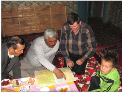
Interview with saiga friend in Jaslyk village.