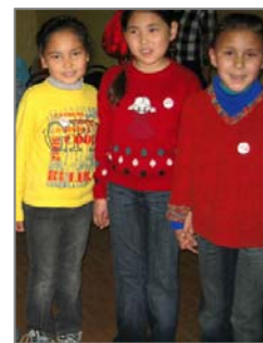
Children at the Arshan Children's Home, Elista, wearing SCA badges after pledging to support the SCA's mission.

We will also target our fund-raising efforts and small grants competitions towards affiliated projects. There are full details about the roles and responsibilities of members and the administrative structures of the SCA in our Constitution, which you can view on our website, or obtain in hard copy on request from any member of the Steering Committee.