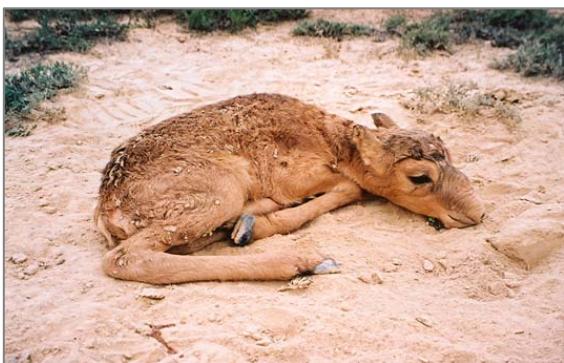
A newborn saiga in Ustyurt plateau, Kazakhstan.

This research was carried out in the Kazakhstan part of Ustyurt, in 2004-2006. In 2004, calving started on 14 May, and between 14 and 26 May, we recorded in total 595 calves. The weight of calves aged 0.5 to 2 days was 3100-3850 g and the body length was 510-600 mm (n=9); on day 3, these values reached 3950-4600 g and 600-660 mm (n=4). The differences in sizes between males and females was insignificant. Of 13 calves, seven males and six females were recorded. The females gave birth mainly to one calf rather than two. Hence, of 133 encounters, in 87 (65%) we recorded one calf and in 46 (35%), two calves. On average, 1.34 calves were born per calving female. The fecundity of the population has therefore decreased; in previous years, 1.5 calves were born per female (including those who did not give birth). Currently, the precise number of non-calving females is impossible to establish. The approximate ratio of "calves to females" is possible to evaluate by using observations from the last two days of the birth period, when when we can be certain that calves were near their mothers, because the animals had already started migrating from the breeding grounds northwards. In this period, we recorded 334 calves and 578 females, i.e. 0.57 calves per female. This ratio appears to be close to the real ratio, as calf-less females were also observed.