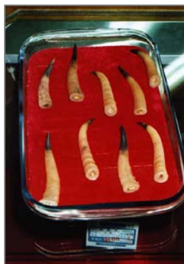
Horns for sale in a Chinese medicine store.

More details are at http://www.interfax.ru/r/B/politics/2.html?id_issue=11656506 .