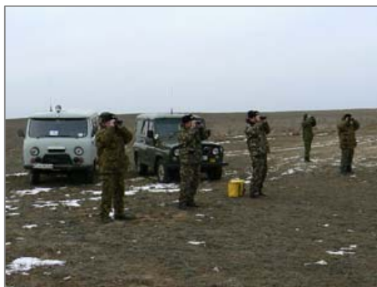
Inspectors on patrol in the steppe.

The reserve has a staff of 10. The inspectors have four vehicles equipped with radios and night vision devices, two Kawasaki and Yamaha sport motorcycles, arms, navigational equipment and binoculars, field equipment and cameras. The inspectors receive regular training on legal documentation etc., and are examined on the safe use of arms and equipment.