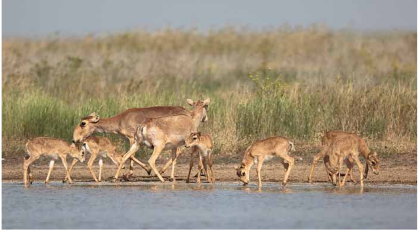
The Betpak-dala saiga population has been recovering since the die-off of 2015.

Our preliminary diagnosis, based on the clinical presentation and necropsy, was HS caused by the bacterium Pasteurellosis multocida serotype B. This diagnosis was supported