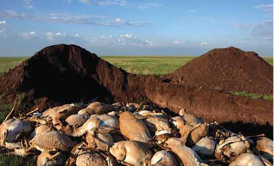
A mass burial ground for dead saigas in Kazakhstan in 2015

Soviet revolution was reduced to a few thousand individuals. A complete ban on hunting allowed populations to recover, and regulated commercial hunting was started in the 1950s. Regulated hunting, principally for meat, continued throughout the Soviet period. Since then, a collapse in funding and infrastructure for saiga management, combined with a disintegrating rural economy, has led to uncontrolled large-scale poaching for meat and horns.'