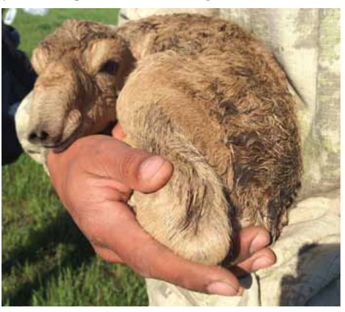
A newborn saiga calf nestles in the arms of a scientist of the joint health monitoring team. Scientists think the saiga's distinctive nose helps filter out dust kicked up during summer migrations and warms up inhaled air in the winter.

A Seasonal migrants—covering a saiga antelopes of the Betpak-dala rangelands normally have access to greater seasonal food supplies than would be available to resident ungulates. Saigas have a very high investment in reproduction. They produce precocial calves—the largest mass at